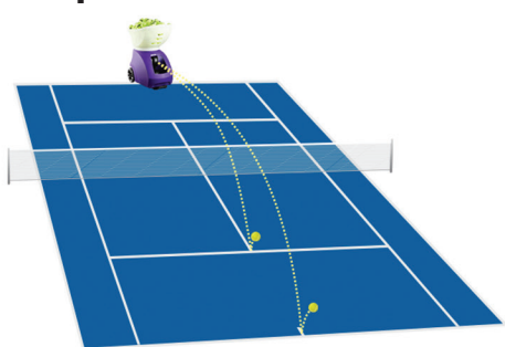
The 'Vertical Oscillation' function has been replaced with 'Vertical Random', so it randomly selects the longest or shortest points rather than sweeping up and down.